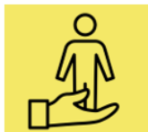
Social Justice and Equity