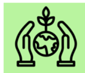
Identity and Diversity