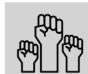
Peace and Conflict