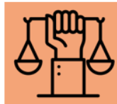
Power and Governance