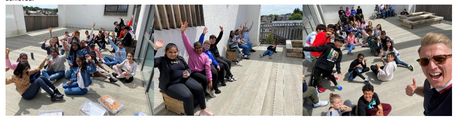
Year 6: As you know, the children have had their SATs exams this week. We are so incredibly proud of them all. They worked so hard over the week and all put in their all! They really were their best versions, and they deserve a treat and a rest this weekend. Well done Year 6! We are so proud of what you have achieved.

In Science this week we continued to investigate forces and how being streamline can affect the speed in which something can travel.