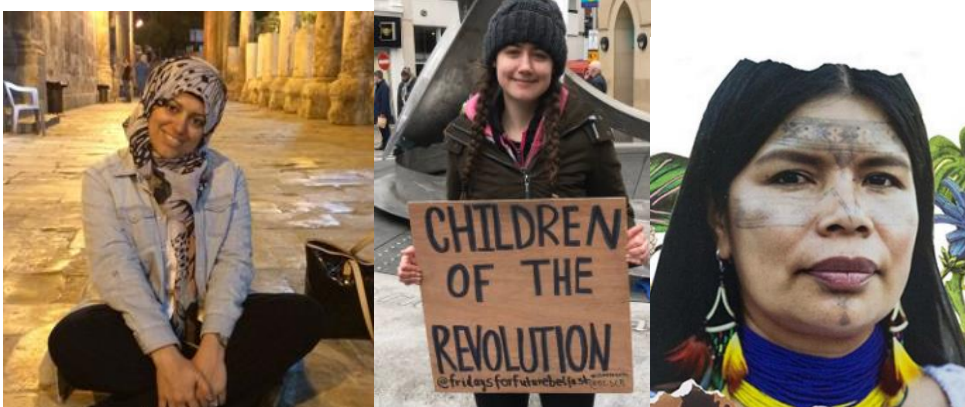
Nassima Al-Sada fought for women’s rights in Saudi Arabia.

On Tuesday 8 th March it was International Women’s Day. Here are a few examples of inspiring women that have been brave enough to stand up for human rights.