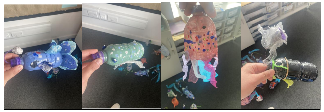
In English this week we were continuing with our instructions writing and in Maths we are still focusing on measuring angles with a protractor. Global Learning was intense this week, we were learning about societies relationships with the Police and whether people are good and bad. We did a lot of art this week and we can see it in our great work. Well done guys.