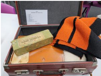
Reading Museum Loan – An Evacuee boy's suitcase - Year 6 WW2

This allows children to learn about diverse cultures, and people who are similar and different to them. As a result, the children see their cultures and ethnicities reflected in history. To enhance our curriculum even further, we regularly loan items from Reading Museum, which gives our children the opportunity to explore real-life artefacts, engaging their interest and feeding their curiosity.