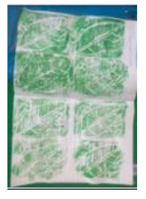
Year 5: First, we would like to say a MASSIVE THANK YOU to all the parents and students who came to support the Year 5 in their Bake and Tote bag sale. The teachers were happy to see the parents face to face properly after 2 years and it was great to see the students enjoying all their hard work. The point of these bags was to smash the stereotypes we may face in our society today. All term we have been learning about women in STEM and how retail affects men. Here are some examples of the Tote bags the students made. The Tote bags, which were sold to create money for the Year 6 residential raised £160. Well done guys!