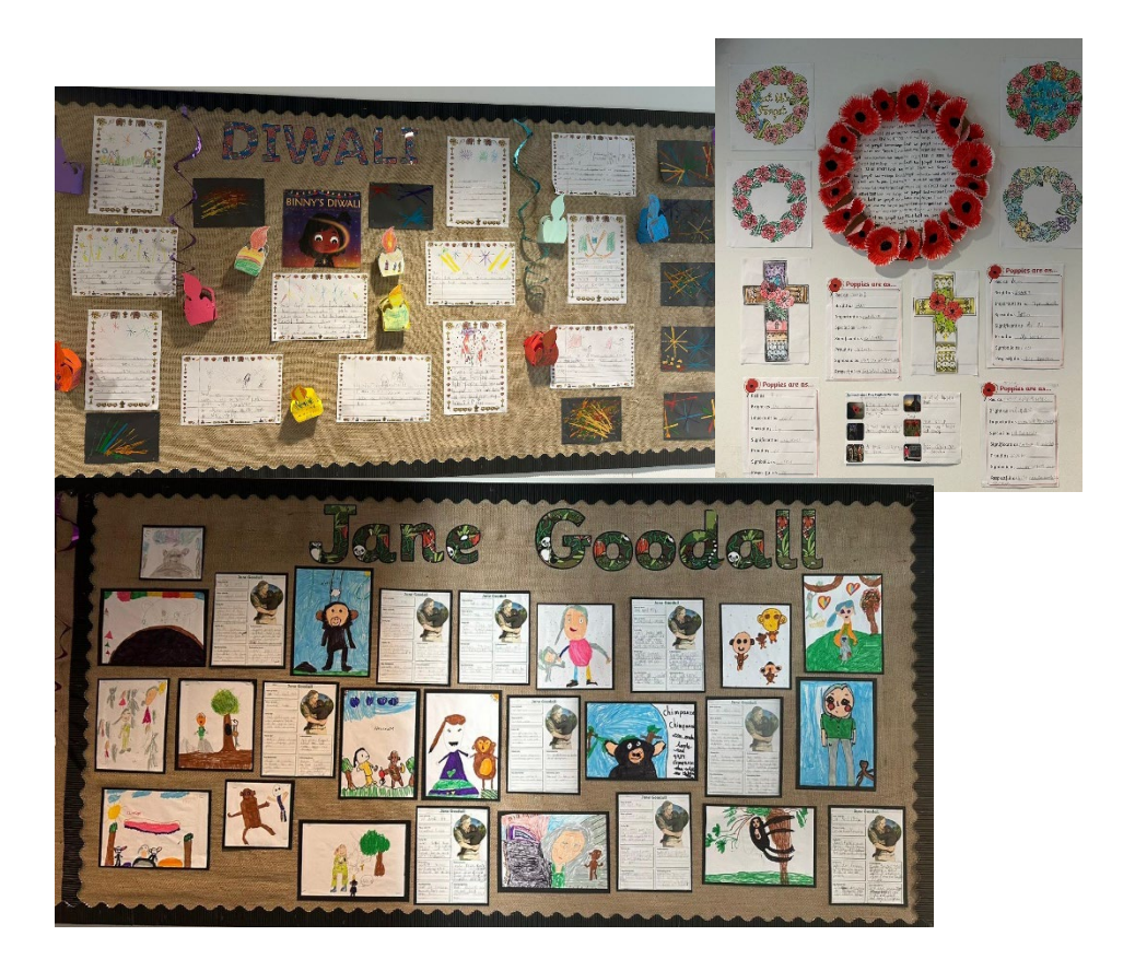
Key Stage 2