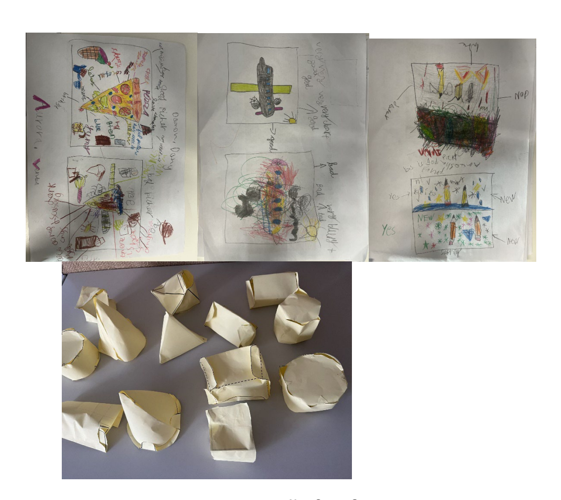
Key Stage 2